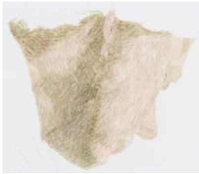
Figure 4: Green for shadow areas, made from Ultramarine and Yellow Ochre.