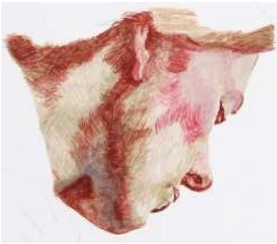
Figure 6: First layer of scumbling*, using umber and white.