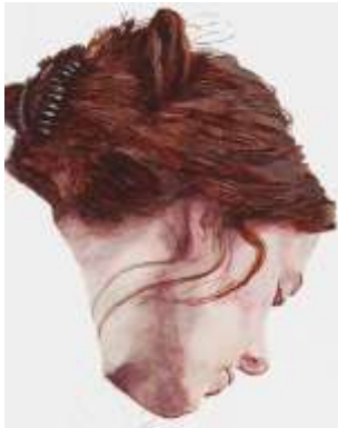
Figure 9: Hair clip -- touch of White for highlight, Blue-Gray to isolate. Deep shadows to define highlights.