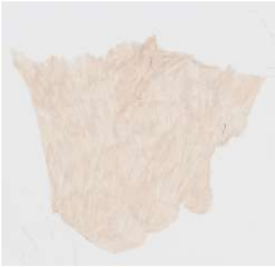
Figure 3: Burnt Umber and White with dry strokes, follow facial contours.