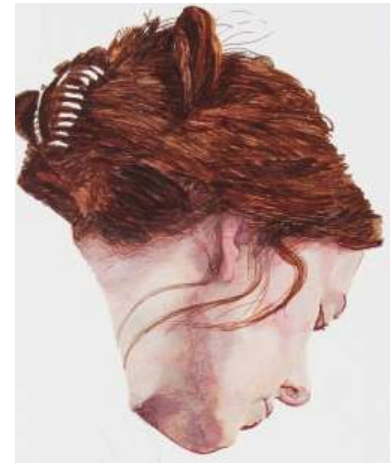
Figure 8: Add Green and Red touches. The hair is Burnt Umber, Ultramarine and Alizarin, with thin strokes following the hair pattern.