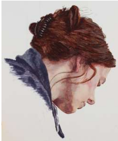
Figure 10: Pea jacket is done with Ultramarine with a touch of Burnt Umber and Alizarin. Add White and Blue scumbled highlights.

* Scumbling is a painting technique where a thin or broken layer of colour is brushed over another so that patches of the color beneath show through. It's done using a dry brush, with a little paint.