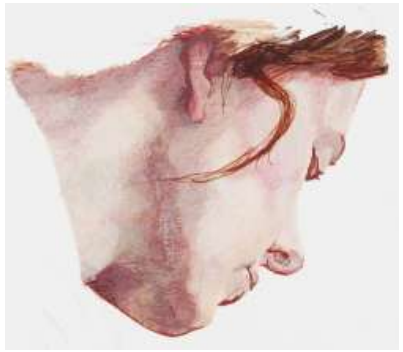
Figure 7: Build up scumbling to develop skin tones. Use Yellow Ochre with White in the warm areas, such as the cheek.