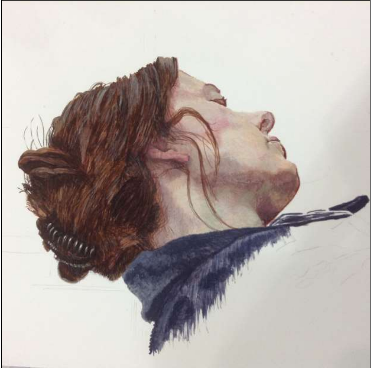
Figure 1: The finished product.

This document contains three pages which show the steps needed to produce the head portrait in egg tempera. Refer to the other documents for the technical aspects of this medium.