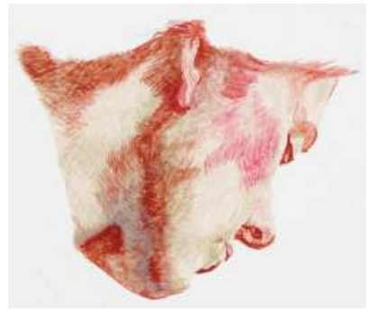
Figure 5: Reds and Pinks -- Alizarin and Burnt Umber, White highlights.