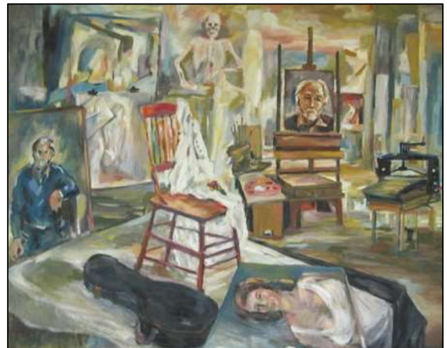
A self portrait