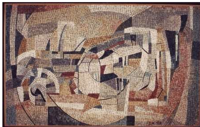
One of Tibor's many mosaics