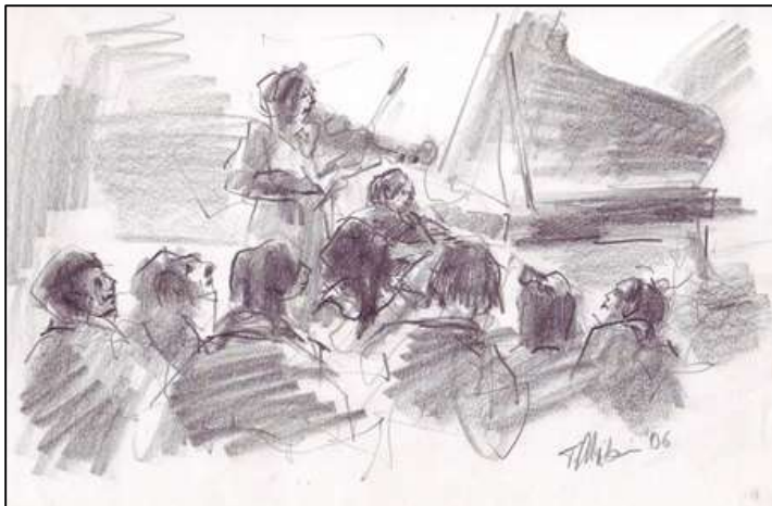
If only we could sketch this way

The world has lost a Great Artist and Fine Gentleman.