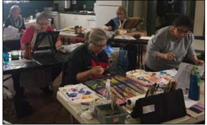
Hands on experience by participant